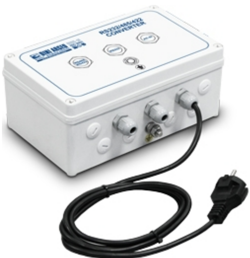
C232485: RS232 / RS485 converter for counter-top use

SETHDIN: Example of installation with DGT4